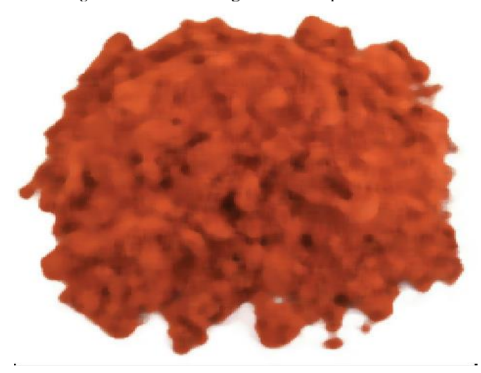
Figure 4: Filtered Image

Resizing images is a crucial change to reduce the output image size. It is expressed as a requirement for the final image instead of defining the actual operations.