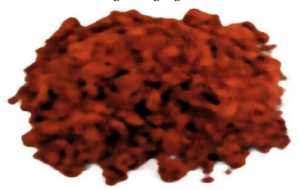
Figure 5: Contrast Enhanced Image Contrast is determined by the difference in the colour and brightness of the image compared to the input image.

Filtering is a technique for modifying or enhancing an image. We can filter an image to highlight certain features.