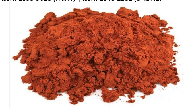
Figure 2: Input Color Image

ISSN: 2393-9028 (PRINT) | ISSN: 2348-2281 (ONLINE)