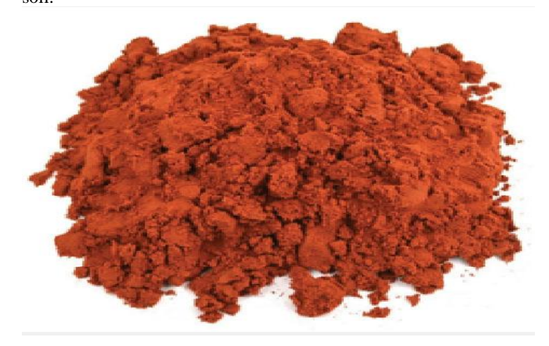
Figure 3: Input Resized Image

The above image is the input image which we give it for the system to map the soil properties of the image based on texture and colour and display the output with name of the soil.