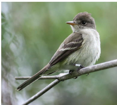
Southwestern Willow Flycatcher.

In yet another victory of science over special interest, the U.S. Fish & Wildlife Service has rejected a petition from developers and landowners to remove the Southwestern Willow Flycatcher from the Endangered Species List. The Southwestern Willow Flycatcher was targeted in 2016 not because its numbers are recovering, but because it stands in the way of development.