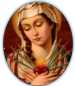
Feast Day: Sept. 15