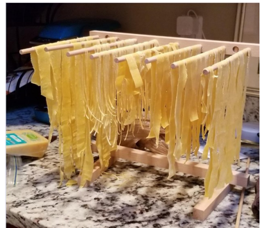
Drying the pasta.