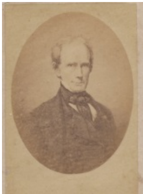
Henry Clay (1777-1852)

Clay regards Jackson's executions at St. Marks and his seizure of Pensacola as "acts of war," carried out in rogue fashion by the General without authorization from Congress, as required in the Constitution.