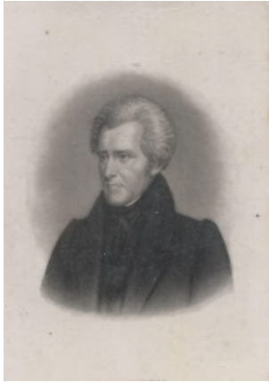
Andrew Jackson (1767-1845)

This ends Jackson's ten week rampage across northern Florida.