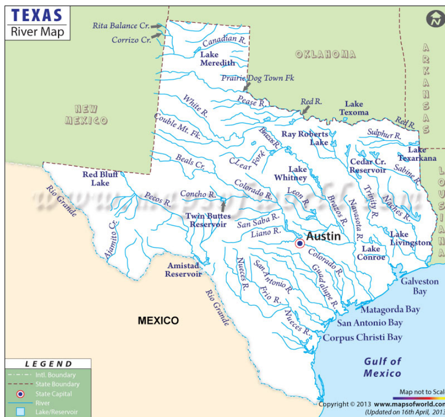
The Disputed Province of Tejas/Texas

Disputes on this have surfaced repeatedly since Napoleon's 1803 sale – and Adams and Onis begin negotiations far apart on their claims. Adams argues that American land should extend to the Rio Grande River, thus encompassing the province of Tejas. Onis counters by asserting that the proper boundary should be far east, at the Mississippi River.