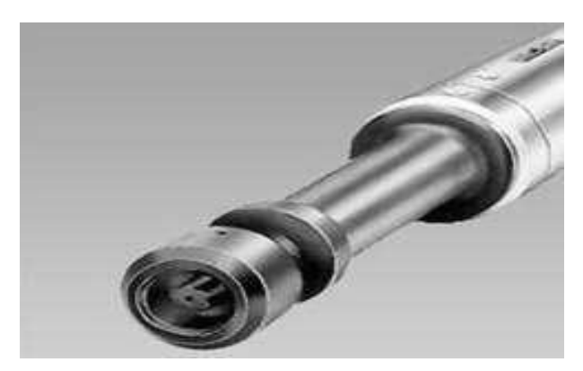
Fig (b):- Shaft

4. Outer box- The outer box of T-Box looks like a rectangular shape. Outer box is normally used for protection purpose. It protects the entire component present in the T-Box system from the atmospheric condition and the rainy season. Outer box are also help in reduce the corrosion problem.