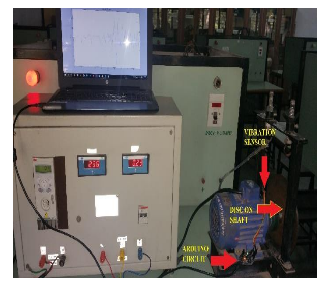
Figure 1. Test bench details; (right on motor) positions of the accelerometer, (right) load unbalance introduced on the disc mounted on the motor.

The Arduino software version 1.6.9 is used in order to sample the signal.