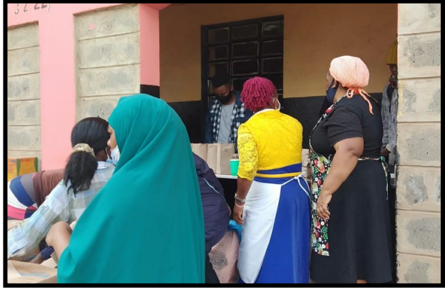
Teachers and staff all participate in the food distribution.