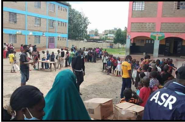
Boxes of food being handed out to MCDC students and their families.