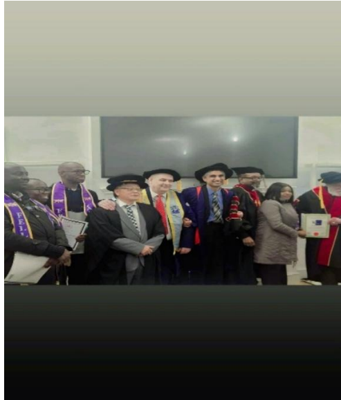
Various Scholars Gather at the 30 th Anniversary Commemoration & Graduation Dinner