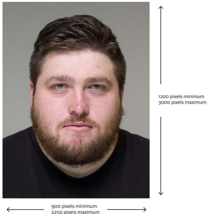
Figure 1: Image size and aspect ratio