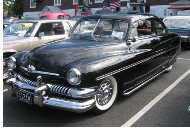
A nice Merc