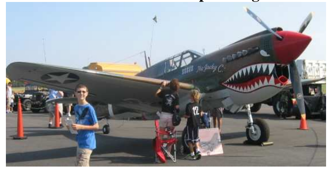
P-40 Flying Tigers