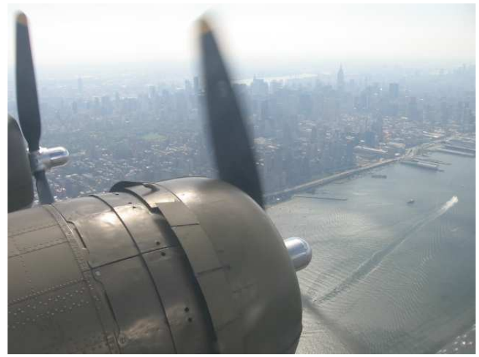
B-17 over NYC