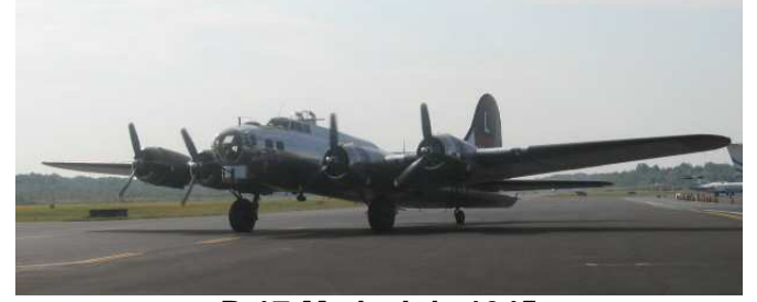
B-17-Made July 1945