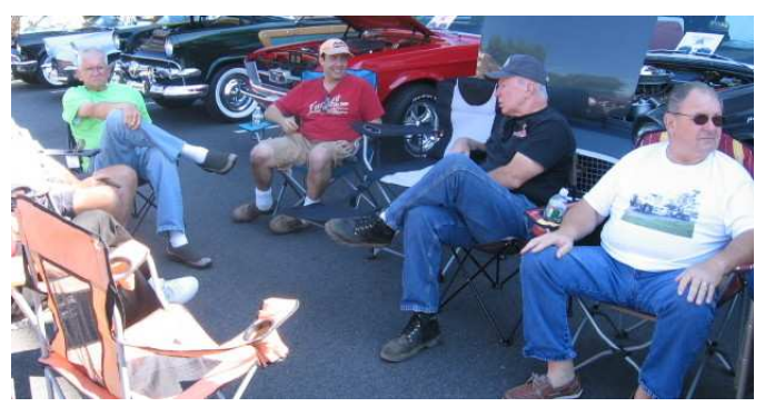
Are having fun yet?