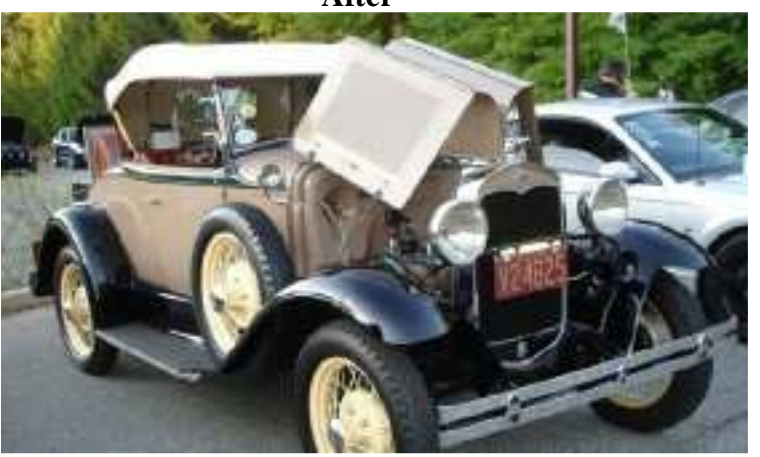
A nice Model A at the show

October is National Cookie Month Yum-Yum