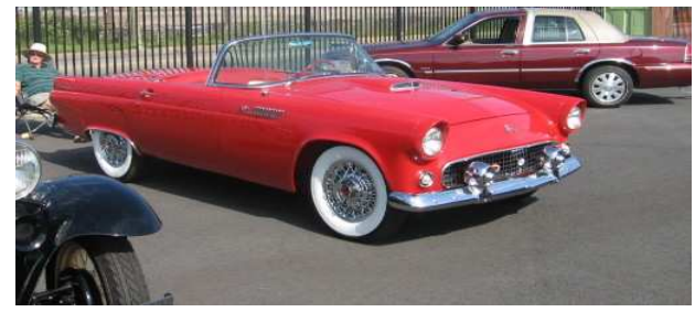
From NY-55 with Supercharger