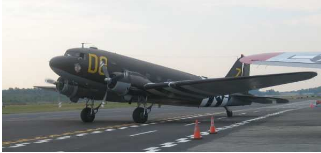
C-47, D-Day survivor