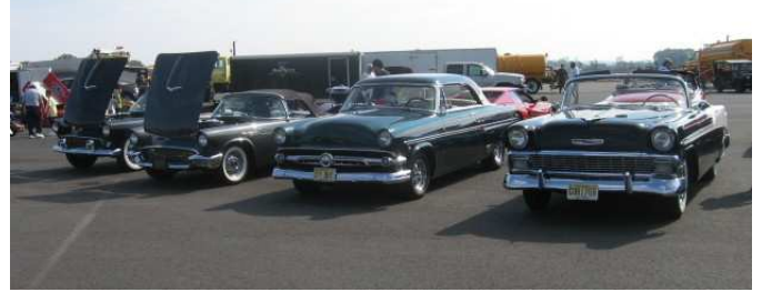
Why do those TBird guys always open their hoods

This was the first or second year of the car part of the show, but it had a very nice turnout of cars most all which were older cars (50's), including a very nice 41 Caddy sedan. The planes, for the most part, were WWII vintage and included a C-47, and a B-17. The planes were great, and I took a ride in the B-17 over the lower Hudson, which was terrific. I only wish there was enough room in the newsletter to include the 30 some pictures I took while in the air. Talk about car collectors, of the planes in the show three of the smaller WWII aircraft were owned by the same person.