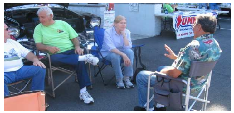
yeah, sure, sure, yeah (baloney??)

A number of members attended this show, which was put on by the Street Legends Car Club which some of our members are also members. Because of a weeks rain delay, attendance was down a bit but it was a good show nevertheless. Some pics: