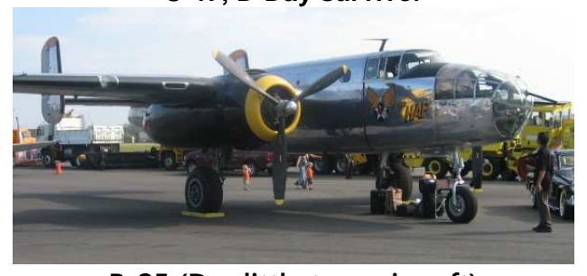
B-25 (Doolittle type aircraft)