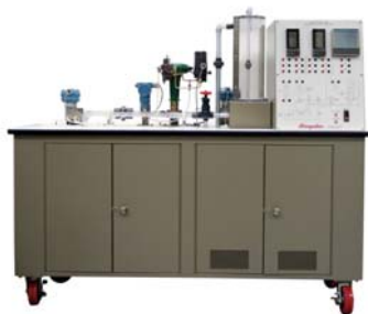
H-ICS-8189 Process Control Trainer