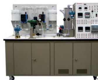
H-ICS-8189-4pH Instrumentation, Controls & pH Control Trainer