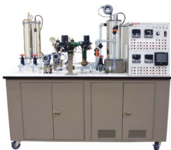
H-ICS-8189-4 Instrumentation & Controls Trainer