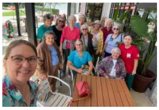
Herbs Make Scents 2025

We then walked to the back of the market to the Alamo Tamale Company. We had the good fortune to find a large table outside where we all fit and were able to have lunch together.