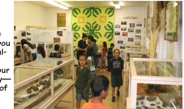
Students of Lāna'i High & Elementary School learn their island history at the Lāna'i CHC (2008).