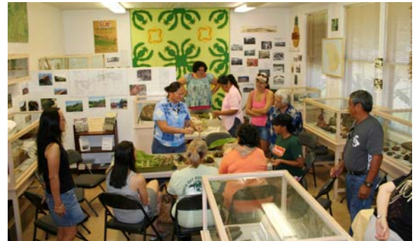
Lei making workshop for residents and visitors at the Lānaʻi CHC (May 2008).

In January 2008, we established Nā Hoaloha o Lānaʻi (The Friends of Lānaʻi) as the giving organization to support the work of the Lānaʻi CHC. The response to the Nā Hoaloha membership drive was extremely generous, with support from Lānaʻi residents, visitors, organizations, family foundations, and Castle & Cooke. As a result of a generous grant from the Trustees of the Office of Hawaiian Affairs, we also have the money necessary to renovate a building, as the new museum-exhibit and curatorial facility. The Board and Director of the Lānaʻi CHC are presently negotiating with Castle & Cooke Resorts, LLC, to secure a facility comprising some 2,200 square feet for this purpose. Our big challenge now is to raise funds to cover our annual operating expenses.