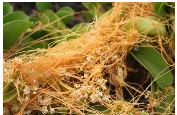
Kauna'oa lei ( Cuscuta Sandwichiana ), the beautiful and now rare flower of Lāna'i, "worn like a feather cloak upon one's shoulders."