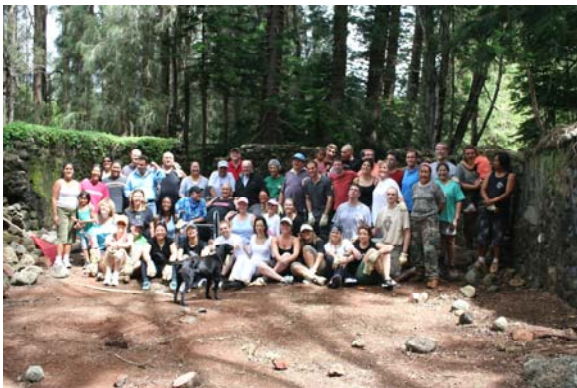
Community members and Four Seasons guests joined together in a service project to clean up the historic Kihamāniania church & school house with the Lāna'i CHC (2008).

Vision – The Lāna'i Culture & Heritage Center seeks to inspire people to be informed, thoughtful and active stewards of Lāna'i's heritage by preserving, interpreting and celebrating its natural history, Hawaiian traditions, diverse heritage and cultures, and ranching and plantation era histories.