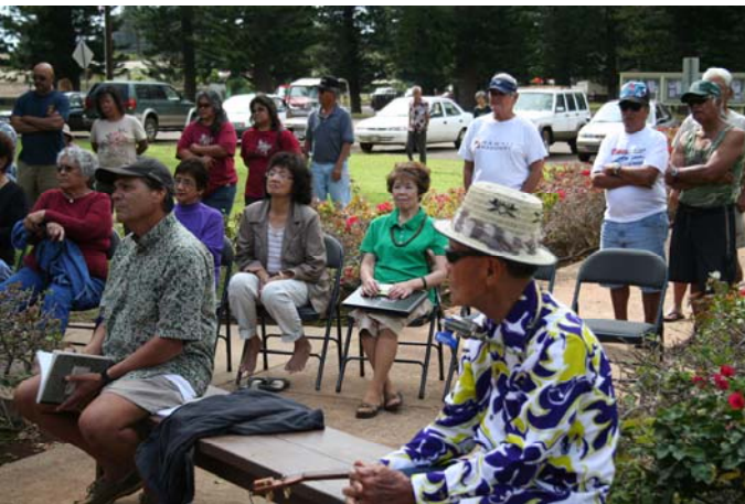
Families of Lānaʻi and guests gather for opening of the "War Heroes" Exhibit—a partnership between the LHES Class of 1956 and the Lānaʻi CHC (Dec. 2008).

We are writing, asking for your help in this year's fundraising drive. We humbly invite you to support Nā Hoaloha and the programs of the Lānaʻi CHC in perpetuating the rich cultural and natural history of Lānaʻi.