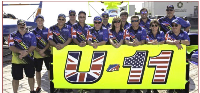
Peters & May Racing