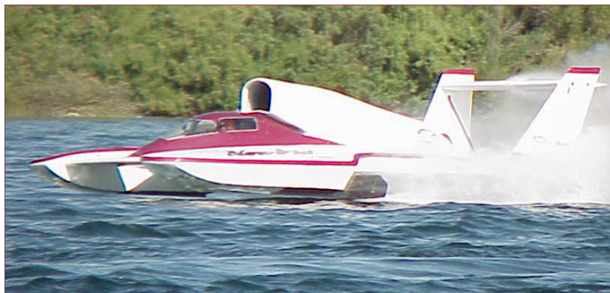
Hydroplane and Raceboat Museum

Not necessarily, but it is an effort, you know. The thing wants to keep comin' on around.