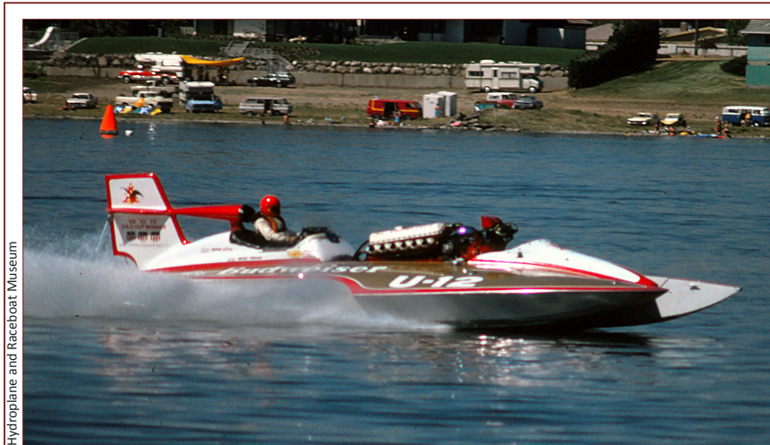
Hydroplane and Raceboat Museum

"On September 9th, 2016 I went to Tri-City Hospital, '#2.' They saw on their special computer