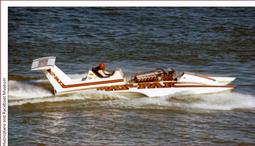
Hydroplane and Raceboat Museum

“I felt I was a Victim of greed. What lying did to me was the crime,