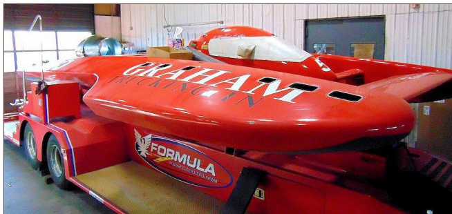
Graham Trucking Racing