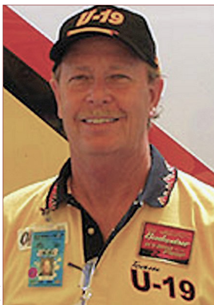
Hydroplane and Raceboat Museum

No, this is inboards. He and his brother raced. My uncle built a couple hydros. The 48s they were running back then, with the