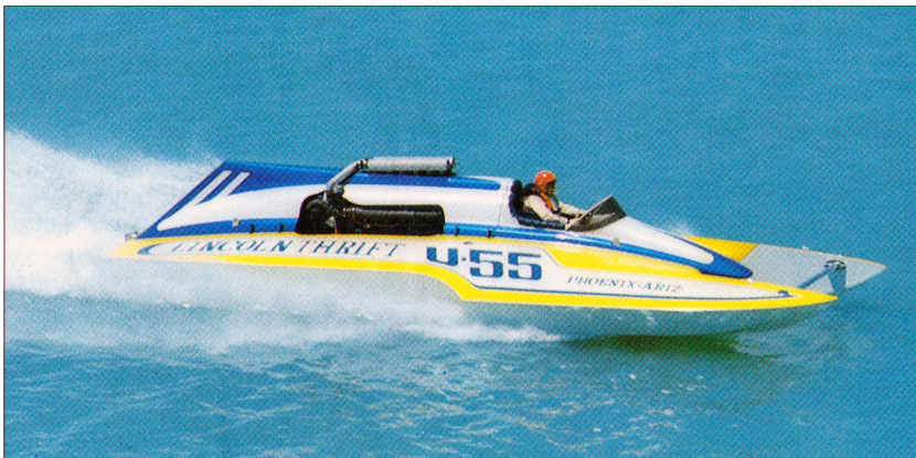
Hydroplane and Raceboat Museum

The Pak team’s biggest disappointment of 1973 was during the APBA Gold Cup race in the Tri-Cities. With a clear lead in the final heat, the Pak lost a propeller blade and Miss Budweiser went on to win the cup.