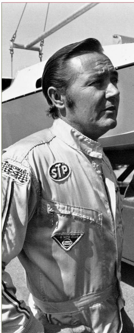
Hydroplane and Raceboat Museum