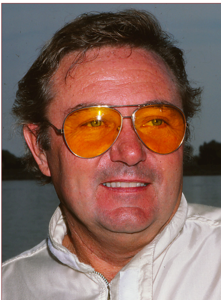
Hydroplane and Raceboat Museum