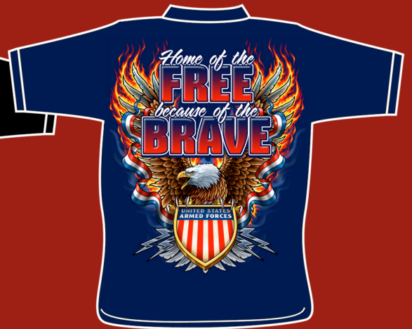
BR1009 HOME OF THE FREE Available on navy blue only.