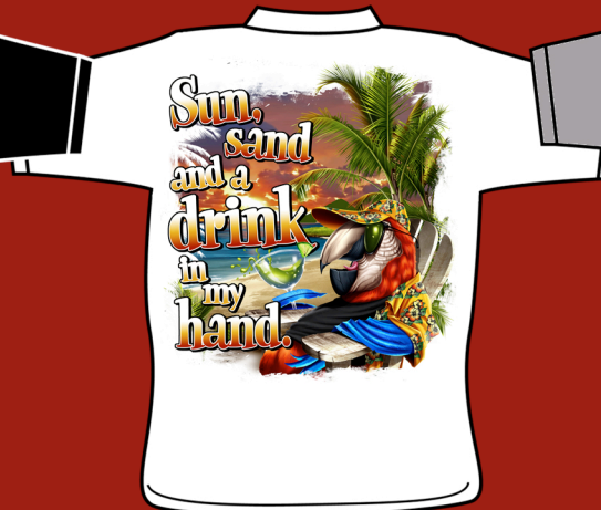
BR1028 DRINK IN MY HAND Available on white only.