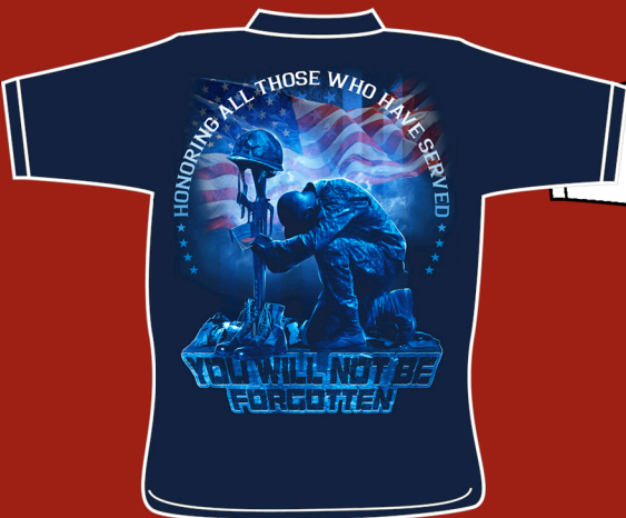
BR1034 HONORING SOLDIER Available on navy blue only.