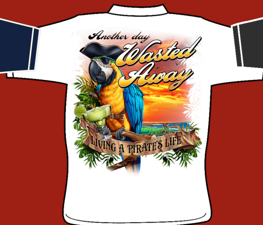
BR1036 WASTED AWAY Available on white only.