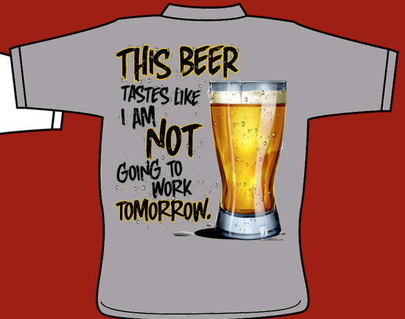
BR1033 NO WORK TOMORROW Available on gravel grey only.