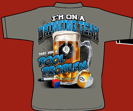
BR1015 POOL PROBLEM Available on charcoal grey only.