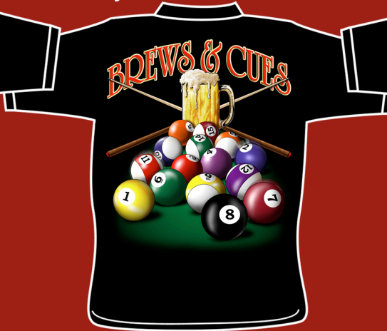
BR1023 BREWS & CUES Available on black only.