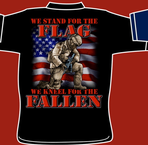
BR1005 WE STAND WE KNEEL Available on black only.