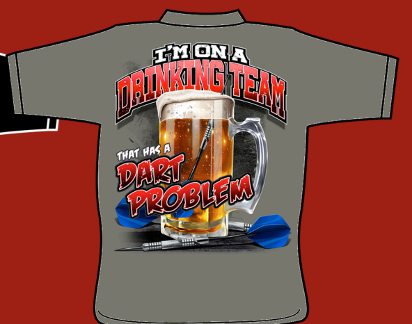
BR1021 DART PROBLEM Available on charcoal grey only.

Designs and styles are subject to change without notice.