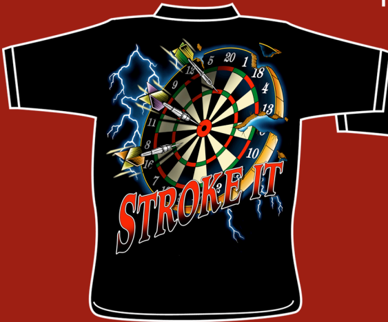
BR1022 STROKE IT Available on black only.

All designs on this page are screen printed on the back. The front of the shirt will be printed with your bar's information.