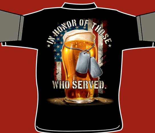
BR1019 DOG TAGS Available on black only.