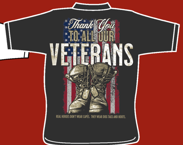
BR1040 THANK YOU VETERANS Available on dark heather grey only.

Designs and styles are subject to change without notice.