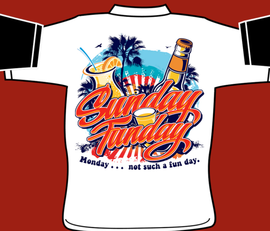
BR1012 SUNDAY FUNDAY Available on white only.