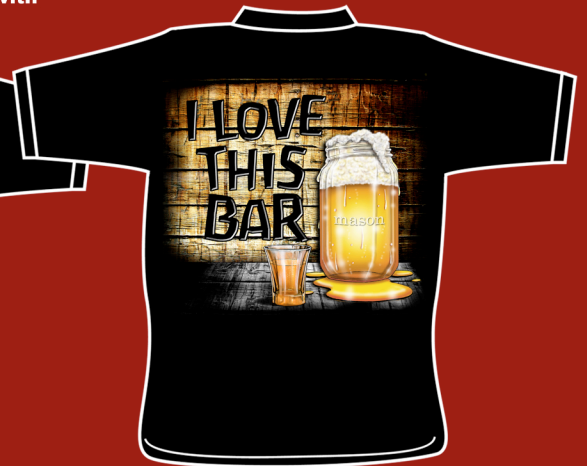
BR1026 I LOVE THIS BAR Available on black only.