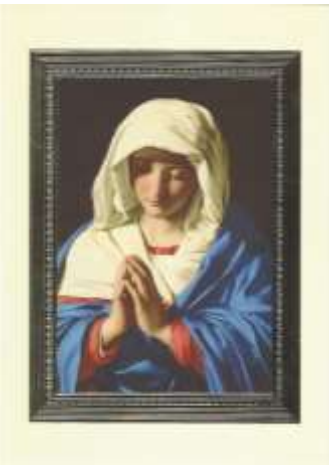
$25.00 per card Perpetual Mass Card