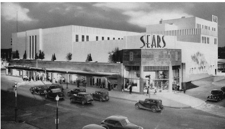
The original Sears Building, ca. 1939