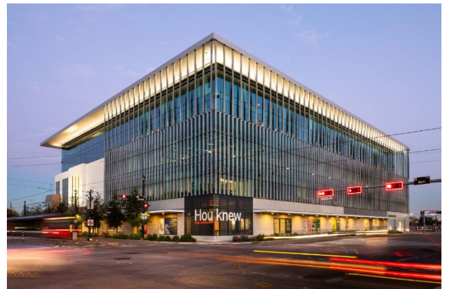
The ION, which opened in 2022