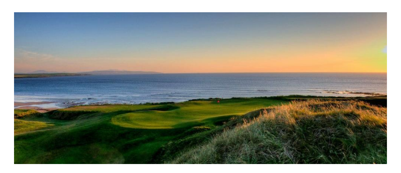
Southwest Ireland Golf Adventure Doonbeg, Killarney, Kinsale and Limerick July 12 - 23, 2020