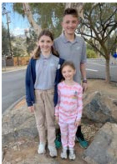
The Trimble Children