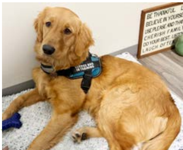
Biscuit, our service dog