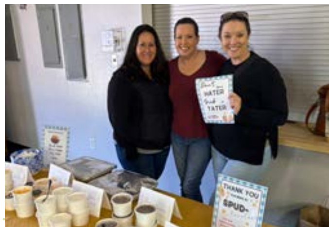
Our fabulous potato bar from the PTF