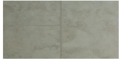
AQU-108 White Onyx