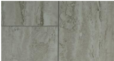
AQU-101 Smoked Coral

Lifetime Residential & 10-year Commercial Limited Warranties