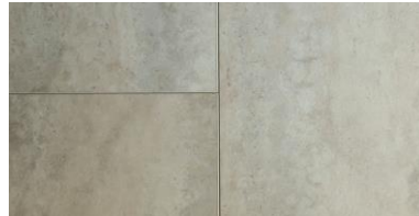
AQU-107 Crema Marfil