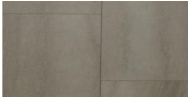
AQU-109 Roman Stone