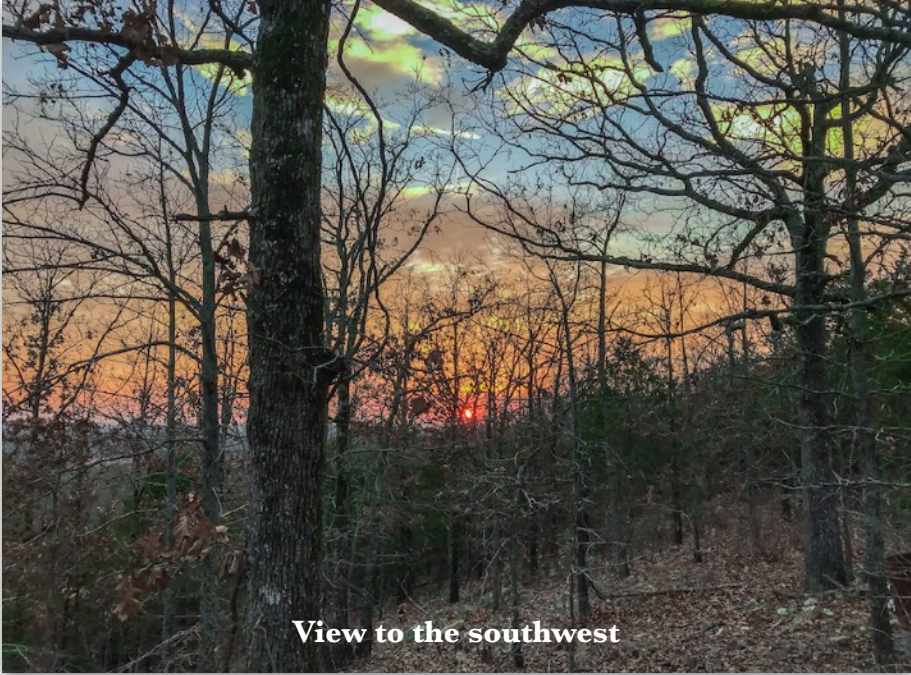
View to the southwest