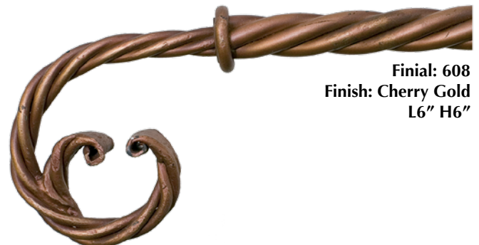
Finial: 608 Finish: Cherry Gold L6" H6"

Journey into Wrought Iron Craftsmanship.