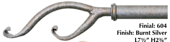
Finial: 604 Finish: Burnt Silver L7½" H2¾"