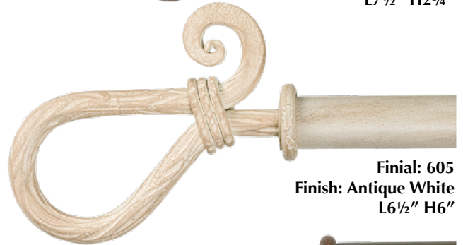
Finial: 605 Finish: Antique White L6½" H6"