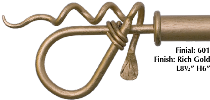
Finial: 601 Finish: Rich Gold L8½" H6"