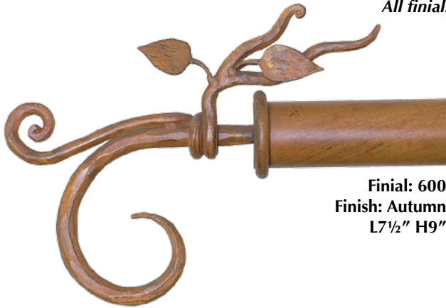
Finial: 600 Finish: Autumn L7½" H9"