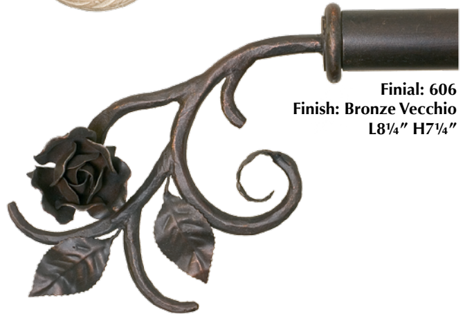
Finial: 606 Finish: Bronze Vecchio L8¼" H7¼"