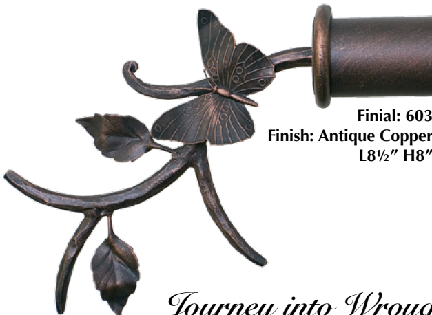
Finial: 603 Finish: Antique Copper L8½" H8"