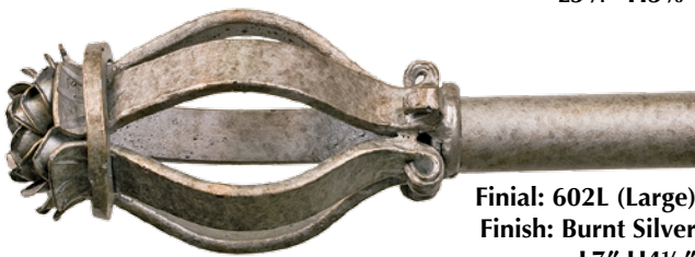
Finial: 602L (Large) Finish: Burnt Silver L7" H4¼"