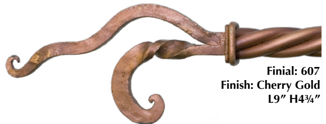
Finial: 607 Finish: Cherry Gold L9" H4¾"