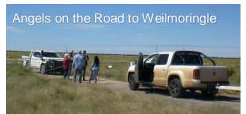
Angels on the Road to Weilmoringle

In the five days we had driven more than 2350km and visited 29 schools, successfully we felt. Our faith tells us that God has begun a good work so, according to His promise, He will finish it. We had distributed more than 500 little booklets telling of God's love and care and we prayed for 63 individuals who received prayer on behalf of 31 communities. We had anointed 30 places to receive God's blessings and angelic presence. Those 2 people who sowed into this trip and who prayed have brought about something wonderful. Thank you Lord!