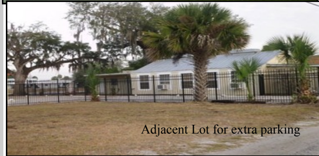
Adjacent Lot for extra parking

Excellent professional office building in the heart of downtown Sanford. Close to shops, dining and the business community. This site has great access and plenty of parking with an additional vacant lot adjacent to the building. For multiple office needs this professional building includes several built-in offices and two bathrooms. Located near the courthouse and county services building with excellent visibility on a corner lot. Previous tenants have been, financial institution, financial advisor broker, and training center.