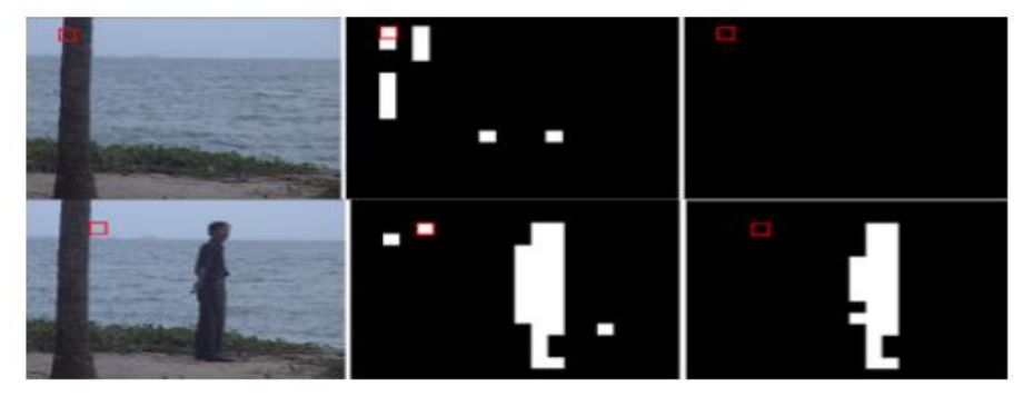
Fig. 1: Block-based background subtraction results with WATERSURFACE. Column 1: Original images. Column 2: Block-based results of HCB .Column 3: Block-based results.<sup>[10]</sup>

large, which leads to noise, as is the case with a block of size 4 \times 4 [Fig. 1(d)]. Conversely, for some sequences, the block of size 8 \times 8 is not sufficiently small, which leads to false subtractions, as is the case with a block of size 16 \times 16 [Fig. 1(b)].