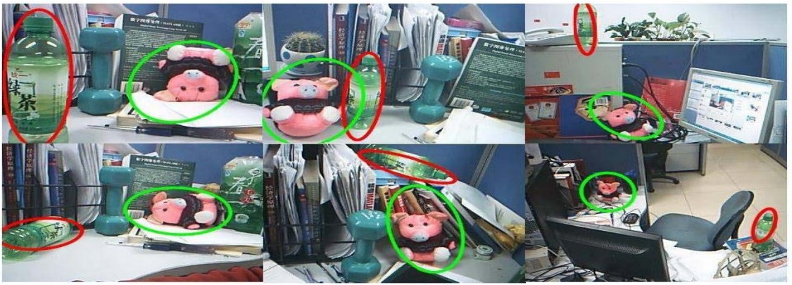
Fig. 2: Detection results of bottles and toy pandas of different scales and orientations.[14]