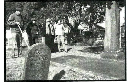
Cemetery tour in progress.