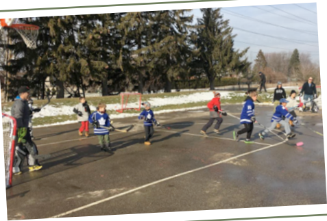
HOCKEY DAY IN SHERWAY