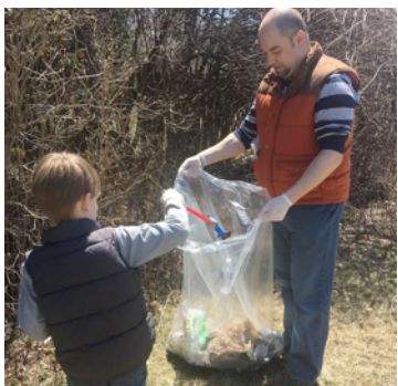
LAUGHTON HEIGHTS PARK EARTH DAY EVENT

In April, our Sherway neighbourhood Earth Day cleanup proved to have a positive impact at Laughton park, the hydro corridor and surrounding areas. In less than two hours volunteers removed litter mainly consisting of food wrappers, bottles, newspapers and bagged animal waste. Collected bags of garbage were removed promptly by Peel region Parks and Recreation.