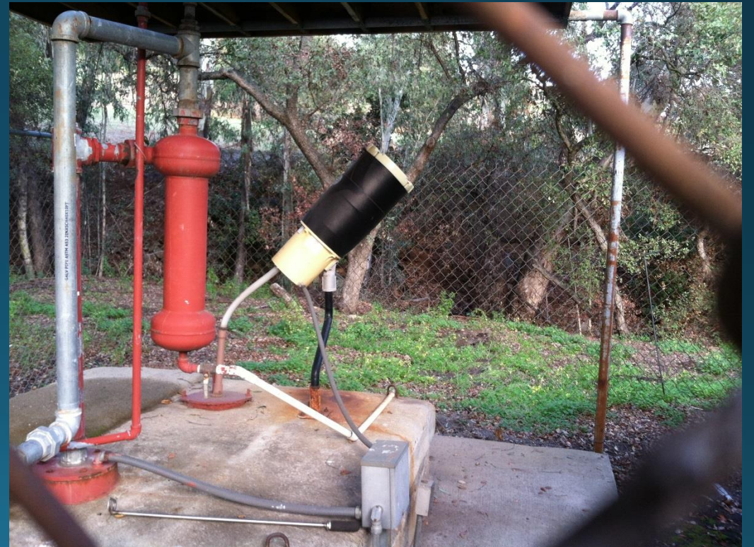
Well Number 3