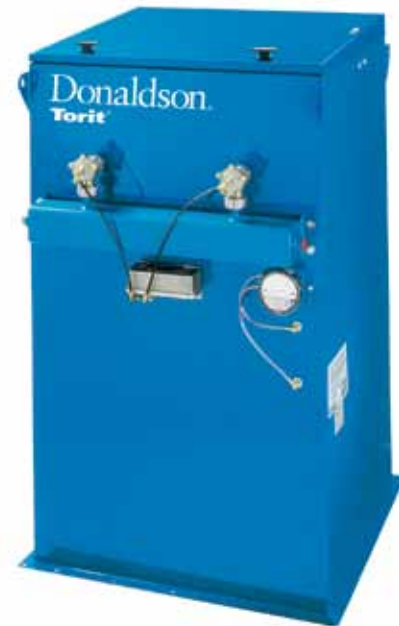
TBV-4 with Plenum

Designed for easy filter service and maintenance—no tools required.