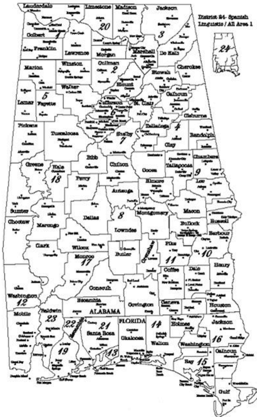
ALCOHOLICS ANONYMOUS AREA 1 ALABAMA/NORTHWEST FLORIDA DISTRICT MAP

Area 01 is comprised of AA Groups in Alabama and NW Florida. It is one of the 93 designated General Service Conference delegate areas of Alcoholics Anonymous within the United States and Canada.