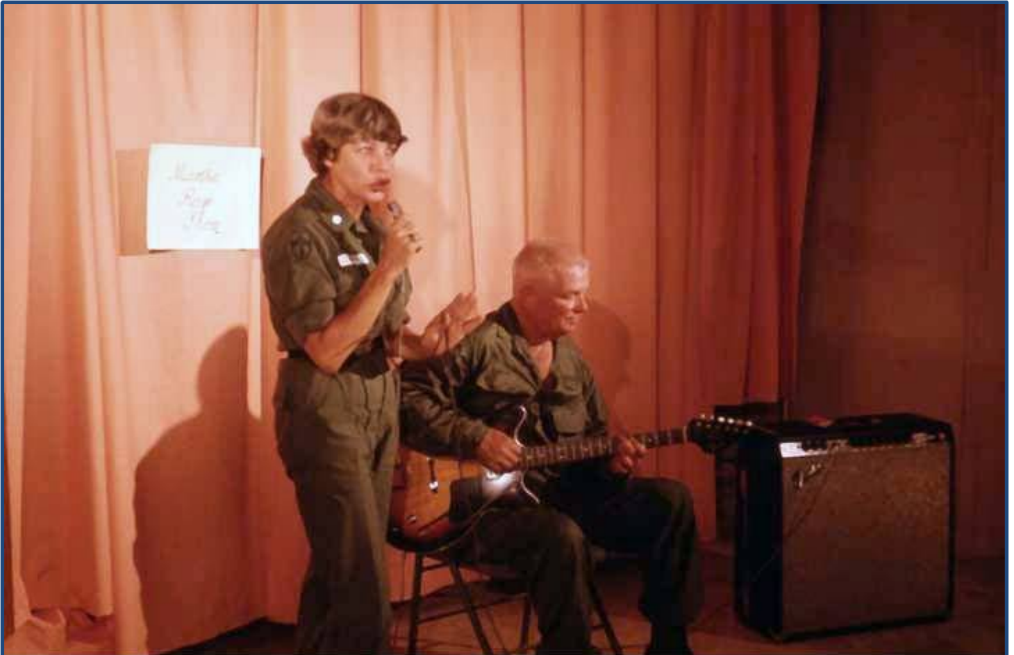
Martha Raye with a local talent guitar player.