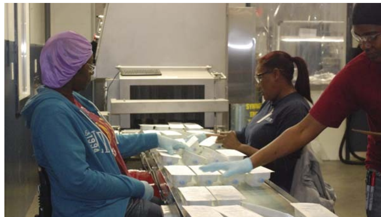
Pictured are employees packaging materials at Coeur, a medical facility in Washington. The facility recently signed a 10-year lease renewal, allowing the business, along with its 144 jobs, to stay in Beaufort County.

The group said North Carolina made the largest ever one-year ranking upswing. However, it was not an unexpected jump since the group projected in October 2013 that tax reforms would "transform one of the worst tax codes in the country into one of the best." "Winston-Salem Journal"