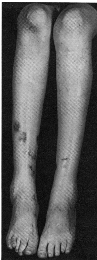
FIG. 3 Case 2. Wide hyperpigmented papyraceous scars over bony prominences of the legs