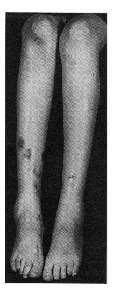
FIG. 3 Case 2. Wide hyperpigmented papyraceous scars over bony prominences of the legs