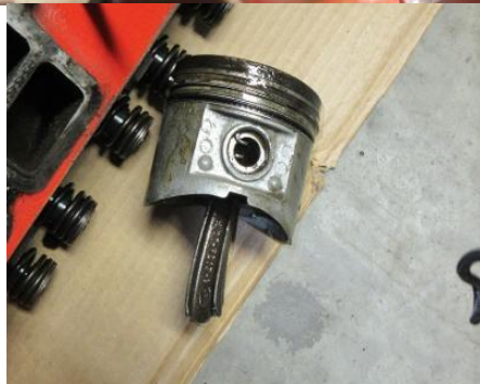
Note the twist