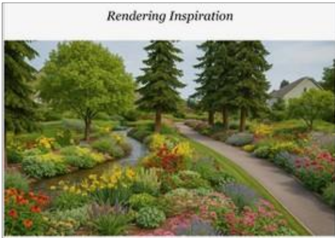
Proposed idea for the back of the clubhouse