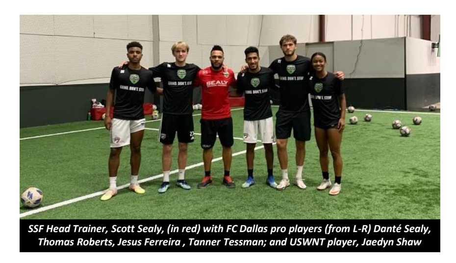
have sworn by the training environment created on a daily basis. SSF's production and success in the technical training industry is unmatched. Visit <a href="https://www.sealysoccerfactory.com">www.sealysoccerfactory.com</a> for more info about their highly successful program.

SSF has not only produced players that have dominated top youth leagues throughout the country, but also, youth national teams, collegiate D1 levels, and the professional ranks. Top male and female talent of all age levels