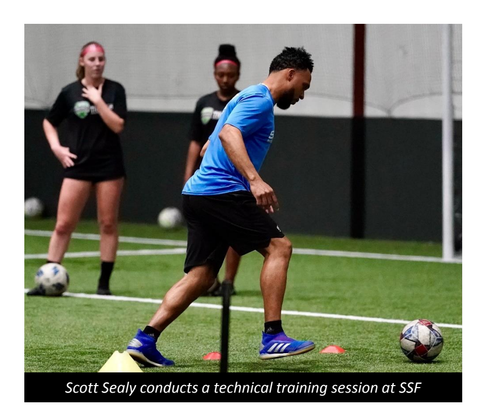
pleasing to the eye. We believe that we're in a fortunate position to have the best technical training accessible to our club and we intend to fully utilize it.

At DFC, we will develop a playing philosophy that relies heavily on technical execution in tight spaces and situations. pressure Technical competence is essential to making our brand flourish - an aggressive passing and movement style of play that will overwhelm the opposition and be aesthetically