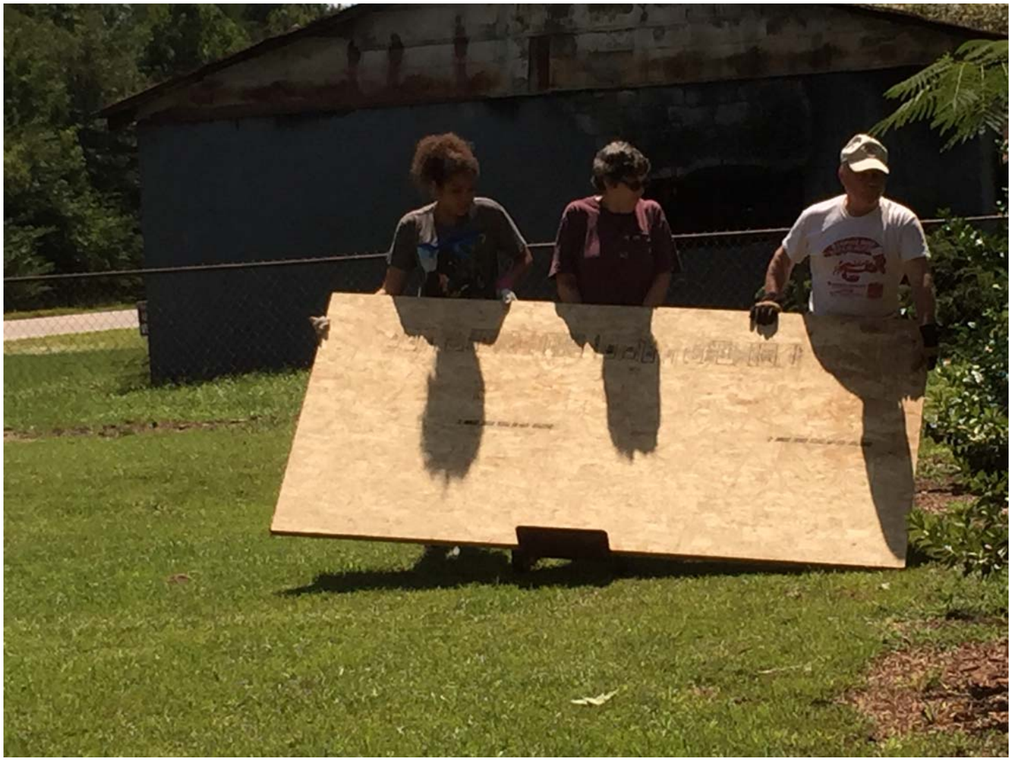
Moving plywood that will become part of the new subfloor.