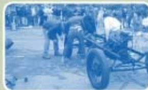
Getting it together...