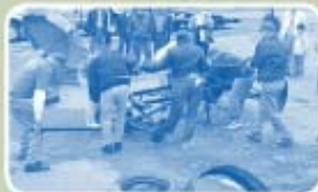
Disassembled 1926 Model-T Ford...