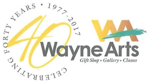
EXHIBIT LABEL INFORMATION

Print two (2) copies. Fill out each completely and legibly. Cut and attach one set of labels to the front of the appropriate pieces. Leave the second page set uncut.