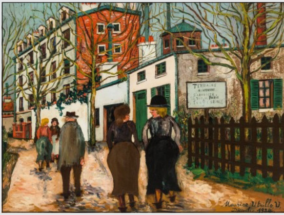
Utrillo Streetscape Lights Up Shapiro Auction

NEW YORK CITY — Shapiro Auctions' May 31 sale of Modern and contemporary art and jewelry was topped by Maurice Utrillo's (French, 1883–1955) "Rue à Ivry," 1924, an example of the artist's famous cityscapes. The oil on board laid on canvas, 20-7/8 by 27-5/8 inches, sold for $150,000. It was signed and dated "Maurice Utrillo, V, Decembre 1924" lower right. For information, www.shapiroauctions.com or 212-717-7500.