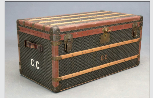
Copake's Unreserved Estate Auction Sends Off Goyard Steamer Trunk

COPAKE, N.Y. — Copake's estate auction on May 20 was filled with the firm's usual mix of Eighteenth and Nineteenth Century, artwork, folk art, period accessories, china, glass, stoneware, primitives and more. A highlight was an early Goyard steamer trunk with fitted interior. Monogrammed on the outside "C.C.," the 39-by-20½-by-19-inch piece of luggage hit ten times its high estimate, finishing at $10,238. For information 518-329-1142 or www.copakeauction.com .