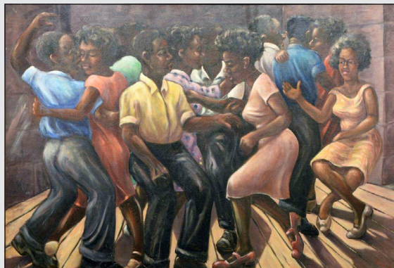
'Social Hour' At Nadeau's Sale

WINDSOR, CONN. — Nadeau's Auction Gallery on May 20 featuring outdoor furnishings, antiques, custom mahogany and decorative accessories saw a lively oil painting by Rex Goreleigh (1902–1986) titled "The Social Hour" perform admirably at $31,000. The work that came from a New Jersey estate depicted African American couples dancing, clad in colorful clothing. For information, www.nadeausauction.com or 860-246-2444.