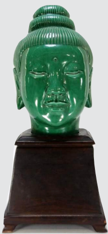
Buddha Head Stars At Bruneau Auctioneers

NEW YORK CITY — Shapiro Auctions' May 31 sale of Modern and contemporary art and jewelry was topped by Maurice Utrillo's (French, 1883–1955) "Rue à Ivry," 1924, an example of the artist's famous cityscapes. The oil on board laid on canvas, 20-7/8 by 27-5/8 inches, sold for $150,000. It was signed and dated "Maurice Utrillo, V, Decembre 1924" lower right. For information, www.shapiroauctions.com or 212-717-7500.