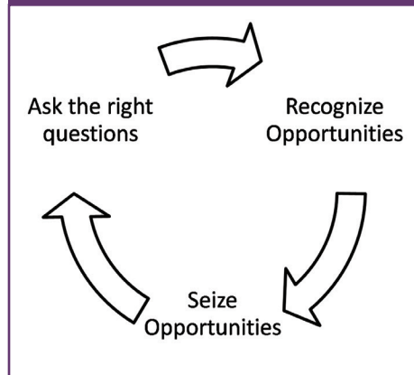
EXHIBIT 2. MODEL OF THE POSITIVE ADAPTATION PROCESS.

FMC learned how to make money in a down market. No other American automaker had done that before. Ford posted a profit of $6.6 billion for 2010. It was the most money the company had made in more than 10 years. Under Mulally, the leadership team captured the value of organizational health and remains one of the world's most profitable automakers.