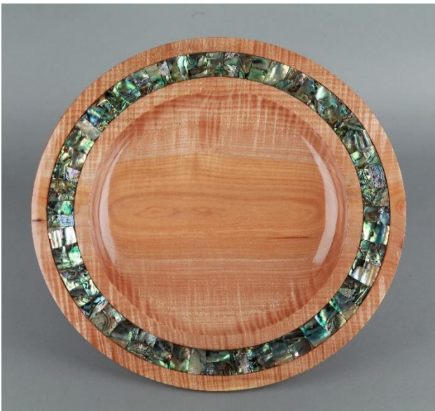
1PLATE WITH NEW ZEALAND SHELL INLAY