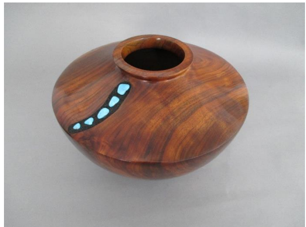
WALNUT BOWL WITH INLAID TURQUOISE