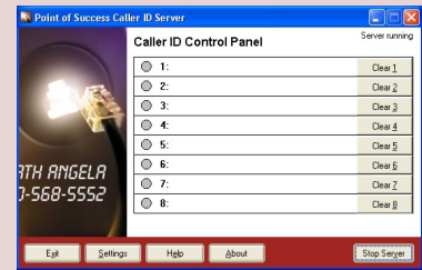
Point of Success Caller ID handles one to eight telephone lines.