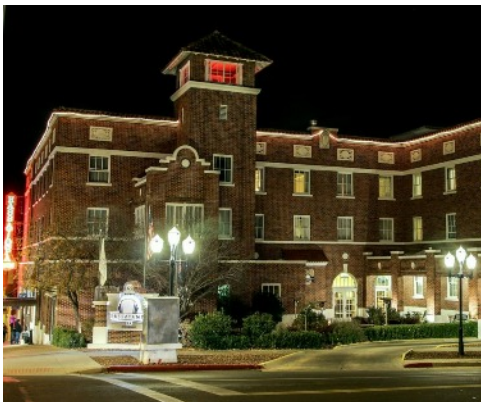
Lunch at the Hassayampa Inn every second Saturday of the month.