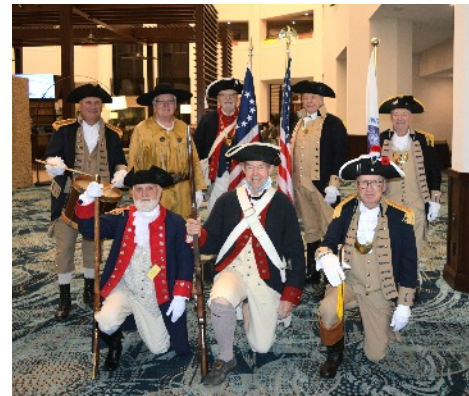
AZSSAR Color Guard at the Board of Managers meeting February 13, 2022

Thanks to all the businesses and individuals that sponsored the Prescott Chapter during 2021 by providing money, items for the silent auction or for not charging for use of facilities.