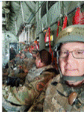
Aboard a C-130 bound for Camp Ripley