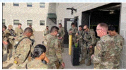
Conducting morning devotional with a group of Airmen as they prepare to start their duty day