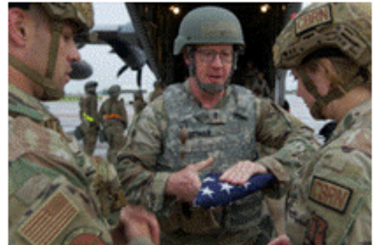
Folding the flag after simulating the dignified transfer of a fallen military member as we arrived back at Minneapolis-St. Paul airport. Morbid as such a practice session might seem, it is an important function that chaplains train to perform in the event of a wartime casualty.