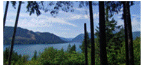
Hard to concentrate with this view from the conference room?!

An afternoon off from training allowed us a little time to hike among the natural beauty of Olympic National Park Forest. What a difference in vegetation from southern MN!