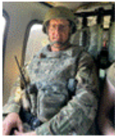
A short simulated Blackhawk helicopter evacuation from an encampment on Camp Ripley