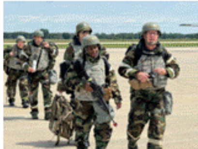
Simulating a hasty evacuation from Volk Field, WI onto our C-130 with additional chemical protective clothing