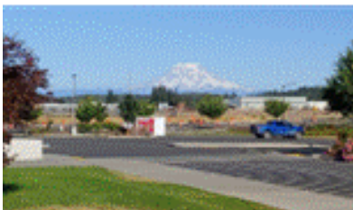
View of Mt. Rainier from Joint Base Lewis-McChord, WA