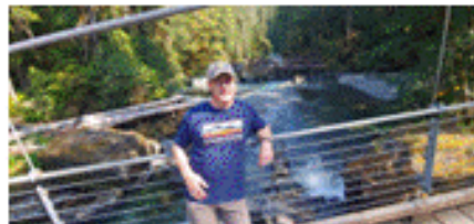
A beautiful stream in Olympic National Park, WA

I bet you didn't know that I was a saint—and had my own Episcopal congregation in Hoodspout, WA! What a beautiful location on the Hood Canal leading out to the Puget Sound & the Pacific Ocean!