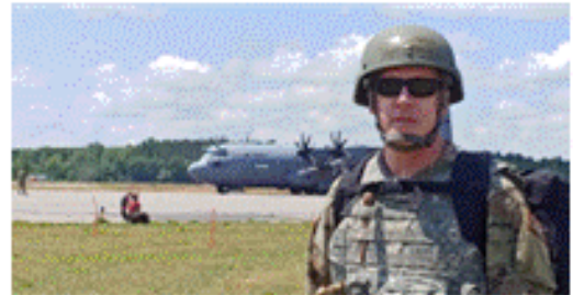
Ready to board a C-130 from Camp Ripley back to MSP & on to Volk Field, WI