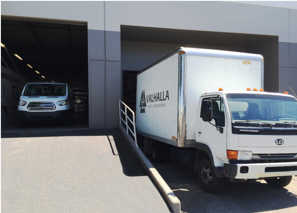
VALHALLA'S FLEET IS ALWAYS READY TO GO!