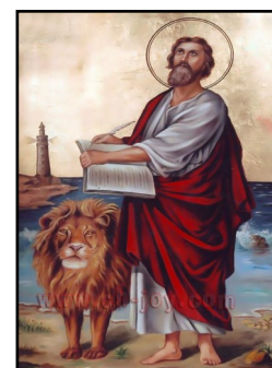
Feast Day: April 25