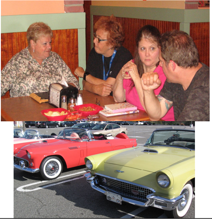
Join CTCI now if you haven't yet. The Early Bird magazine alone is worth the dues